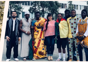
... sharing knowledge about native countries