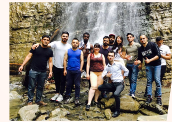
... travelling to beautiful places