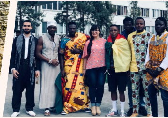
... sharing knowledge about native countries